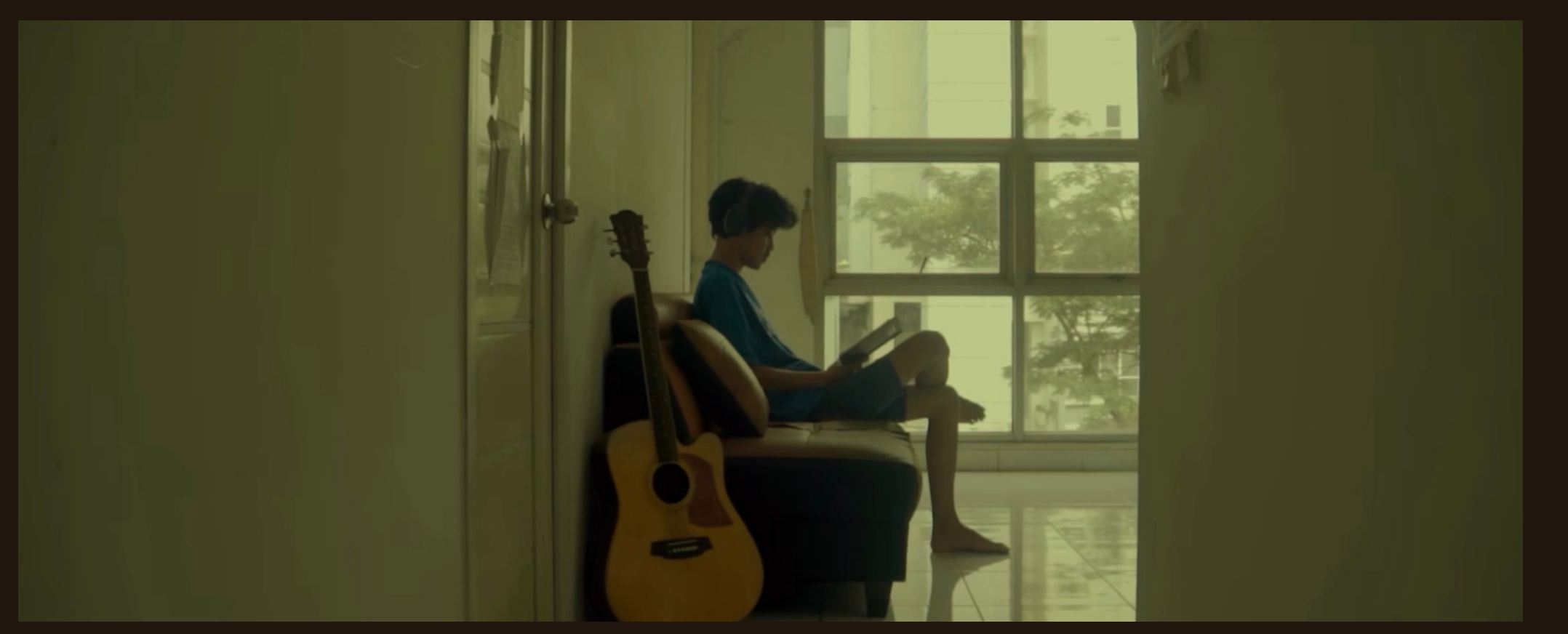
Wes Anderson X Danesaurus fusion

Wide shots 16:9 aspect ratio Lens 20 Mm Output blanking 2.39 size Centred