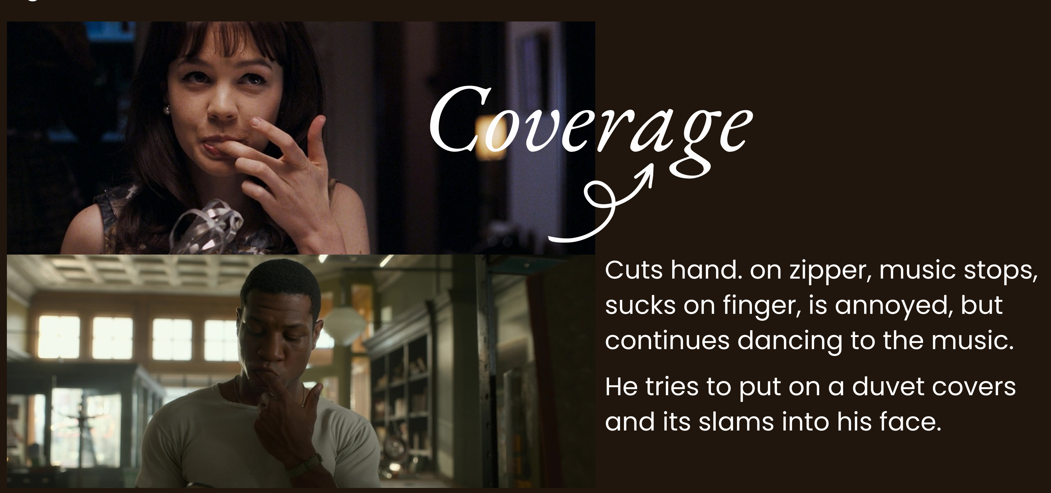
Ugh. What a mood kill.